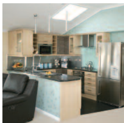
quality well designed kitchen with ample storage space